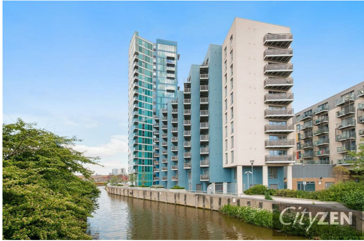
GEORGE HUDSON TOWER