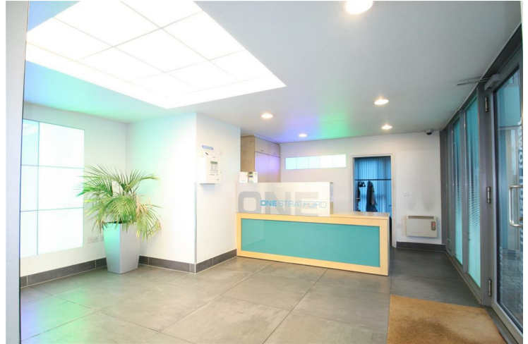
CONCIERGE / RECEPTION