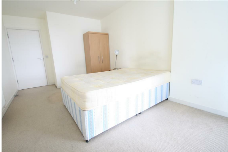
BEDROOM TWO VIEW