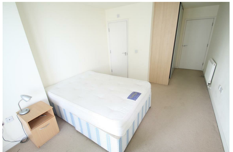
MASTER BEDROOM VIEW