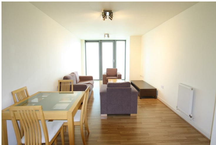
LIVING SPACE VIEW